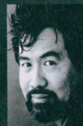
David Henry Hwang