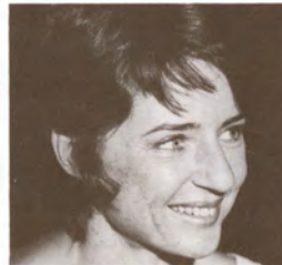
Stephanie St. Clair